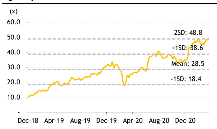
Fig 2: 1-year forward PER