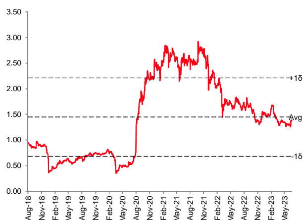
EXHIBIT 4: PE BAND CHART