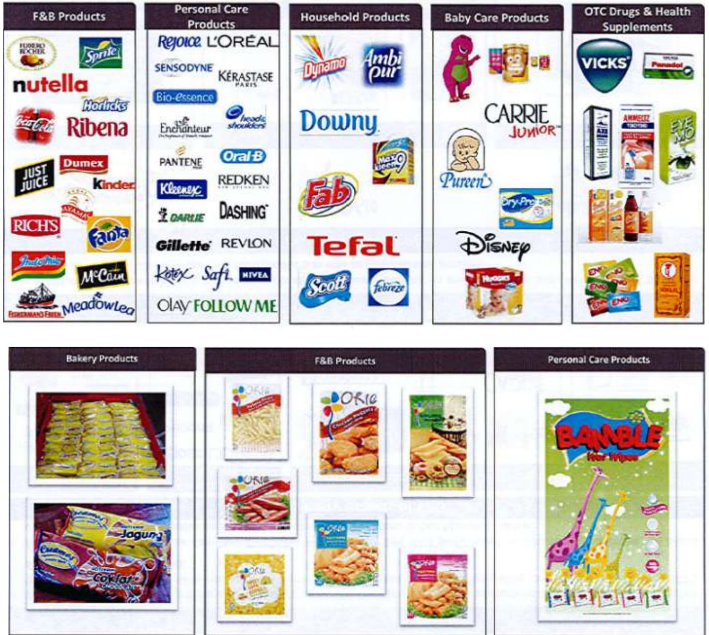
Exhibit 4: CPG brands portfolio