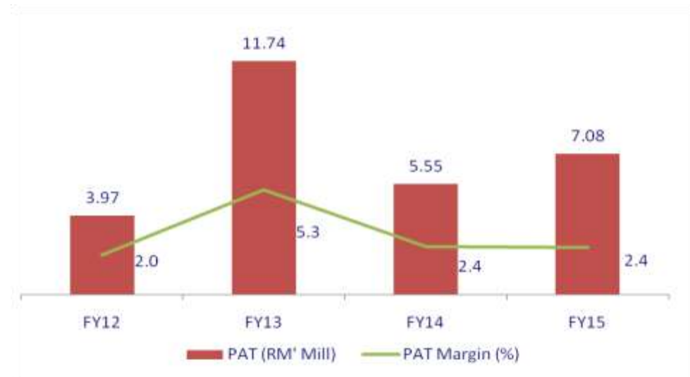
Exhibit 6: PAT vs PAT Margin