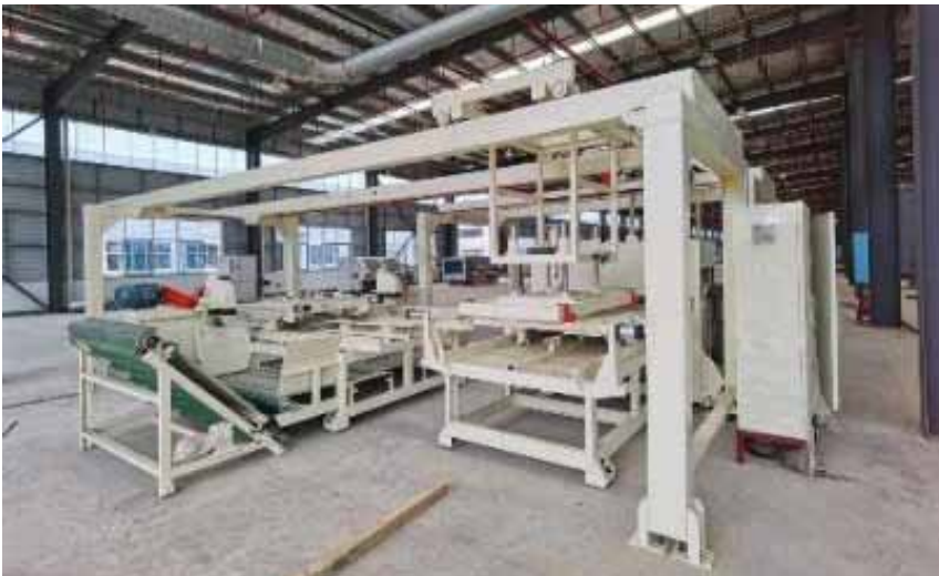
Figure 1 Bamboo processing machinery at the Kanger plant in Jingzhou

During the financial period under review, operations at our bamboo business segment were dampened due to the relocation of our bamboo processing manufacturing operations from Ganzhou to Jingzhou, PRC. With the completion of the construction of our new plant in the fourth quarter of 2020, we are poised for greater recovery by way of commencement of higher production capacities and operating efficiencies from the use of modern bamboo processing machinery and equipment.