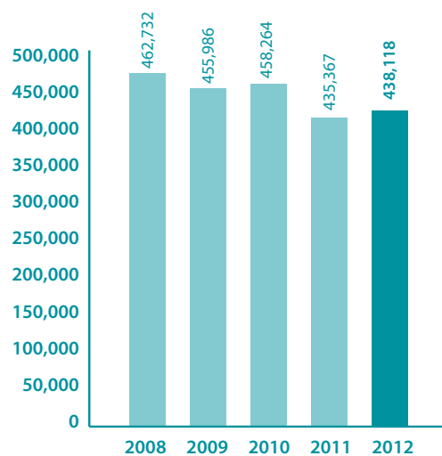
Shareholders' funds (RM'000)