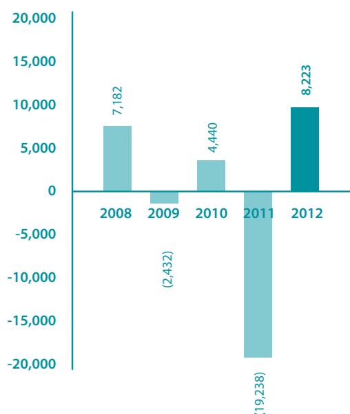
Profit / (Loss) before taxation (RM'000)