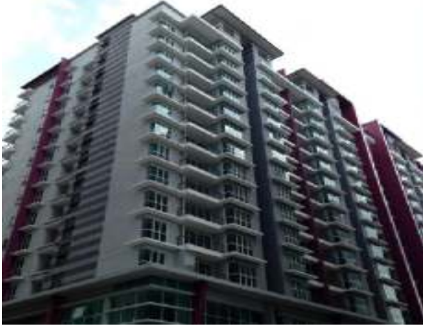
Fig 2: Pacific Place Ara Damansara