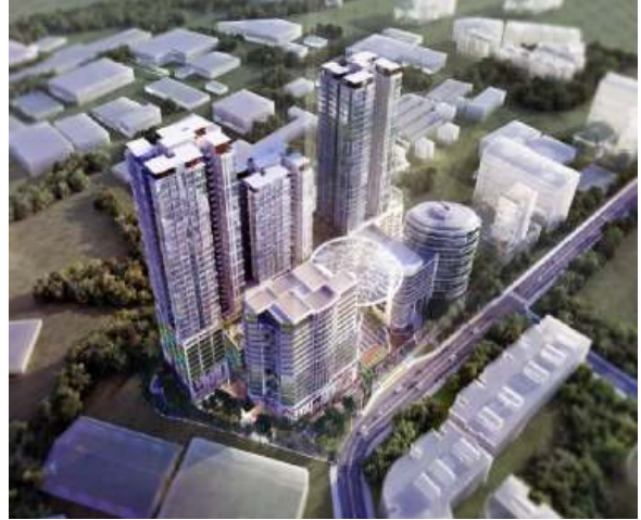
Fig 3: Pacific Star Ara Damansara