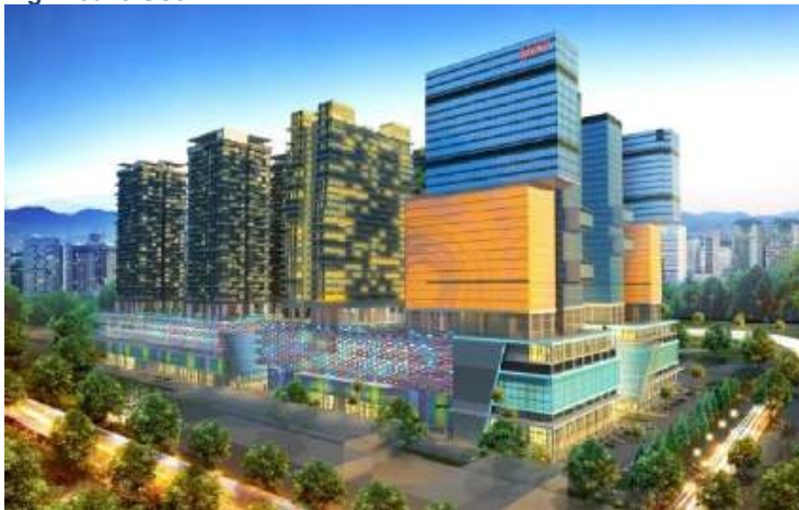
Fig 4: Jaks USJ 1

Besides that, Jaks intends to embark on the Jaks USJ 1 project, which involves redeveloping the site of its existing headquarters in Lot 526, Persiaran Subang Permai into a mixed-use development with a GDV of about RM2bn. The proposed development will mainly be comprised of Jaks Tower, 3 blocks of office suites and 6 blocks of service apartments. In addition, there will be a 3-storey commercial podium within the mixed-use development. We understand from management that the project may be launched in 2H15.